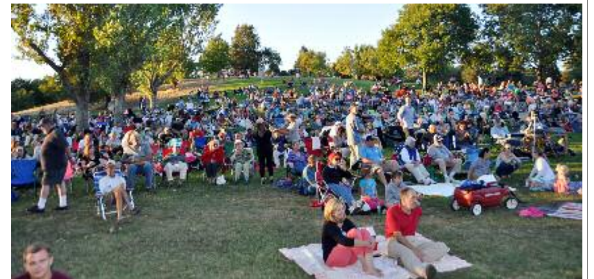
Big turnout at last year's Summer Concert Series